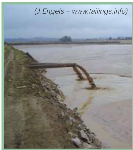
Tailings material – water and ground rock – is transported from the mill to the tailings storage area via pipeline.