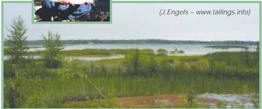
A reclaimed tailings pond in Sudbury, Ontario, Canada.

before development, former tailings ponds can become lakes capable of supporting fish populations. Land areas become revegetated and provide habitat for local wildlife.