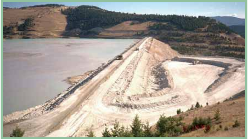
A tailings embankment – or barrier – is usually built at the low end of a valley to contain tailings material. (A tailings embankment near Jefferson City, Montana.)

As the volume of tailings material contained in the storage area grows, so too must the height of the tailings embankment and the elevation of the tailings pipeline. Each stage of the process is carefully planned, highly engineered and carefully scrutinized by state and federal experts.