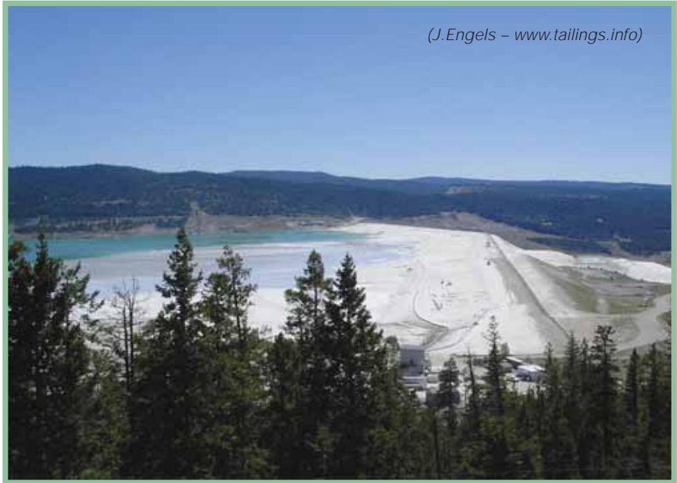
A tailings storage facility at the Highland Valley Mine in British Columbia.

This backgrounder is intended to provide Pebble Project stakeholders with an understanding of the issues and considerations for tailings management.