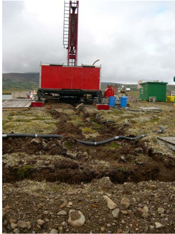
Figure 1. Rig no. 5 on new site. Trench leads from rig to sump pit.