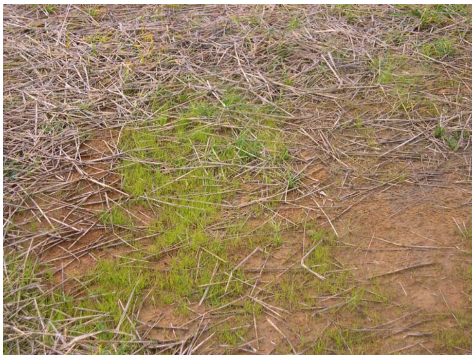
Figure 8. Reclamation site 6355 showing revegetation.