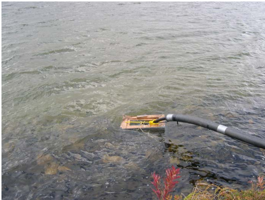
Figure 4. Water intake structure for drill site no. 7374 and for rig no. 5 new drill site. Note cover missing on intake box.