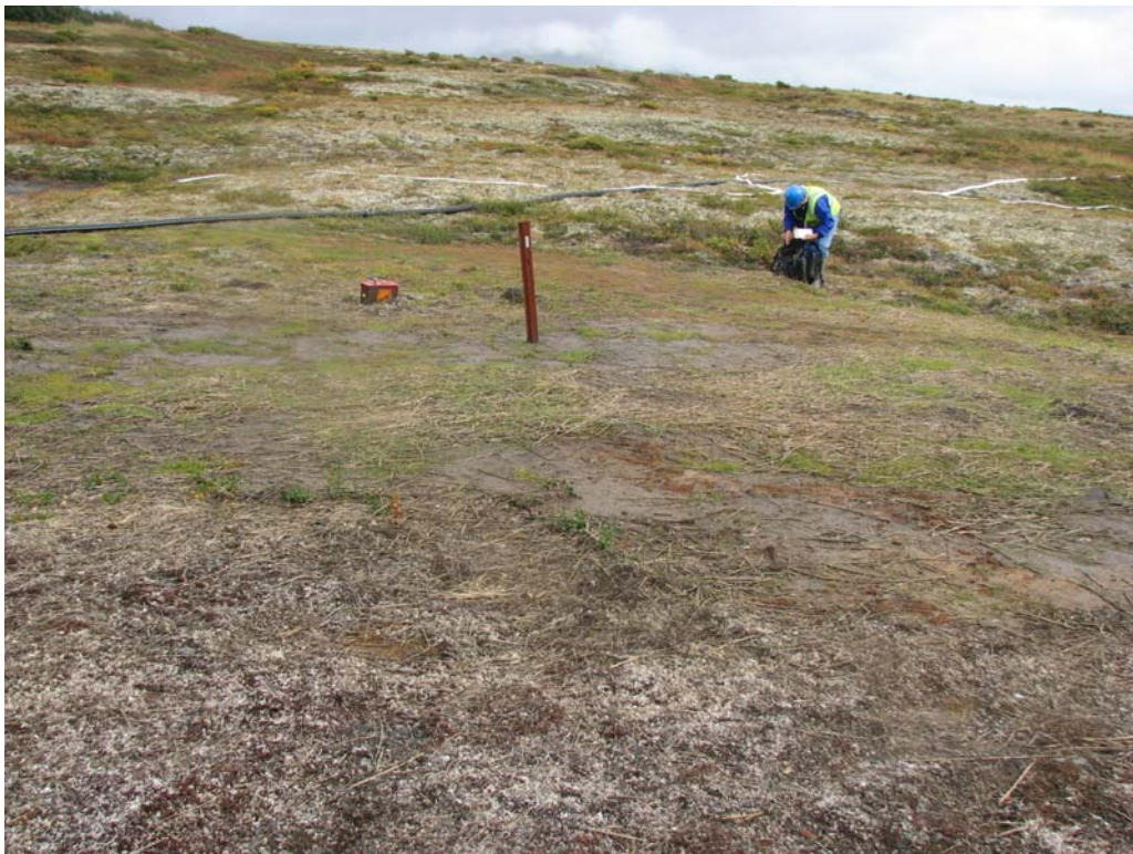
Figure 7. Reclamation Site no. 6355.