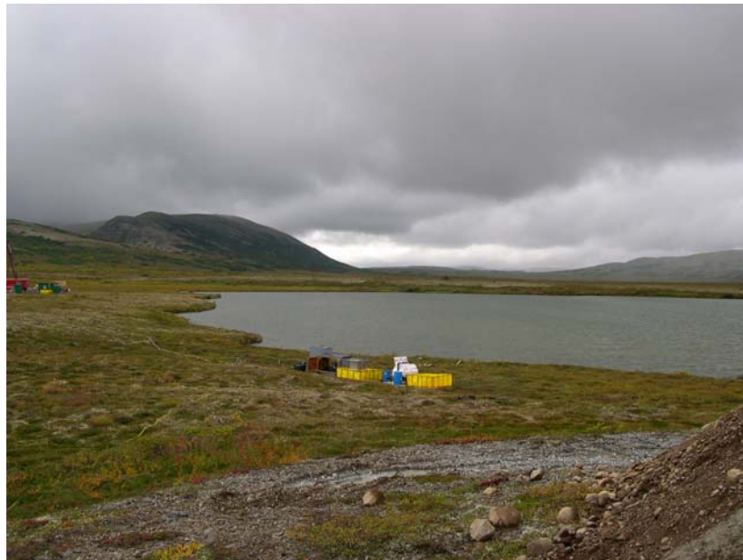
Figure 2. Water source for drill site no. 7374 and for rig no. 5 new drill site. Note pumping station for the water in the foreground. Rig no. 5 visible in the left background.