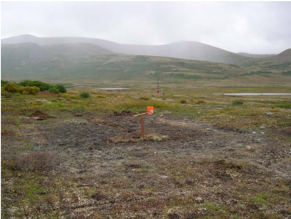
Figure 6. Reclamation site 7368.