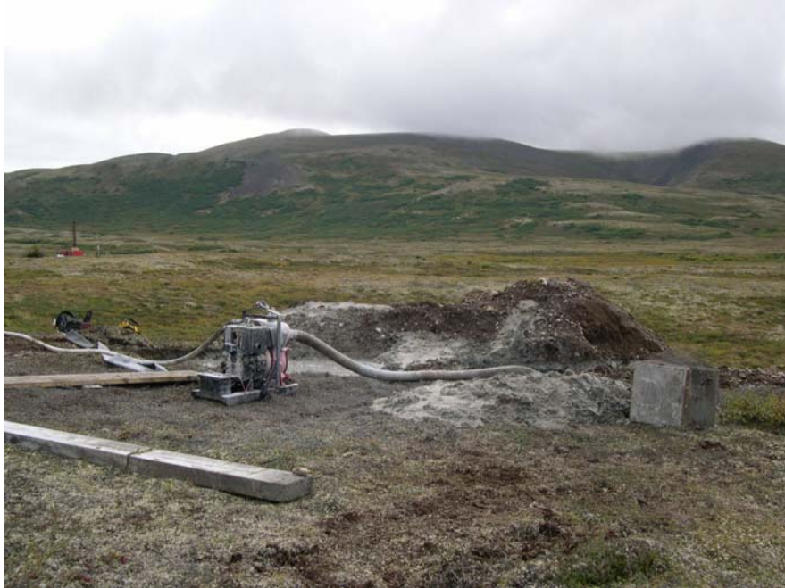
Figure 3. Signs of sump overflow on drill site no. 7374.