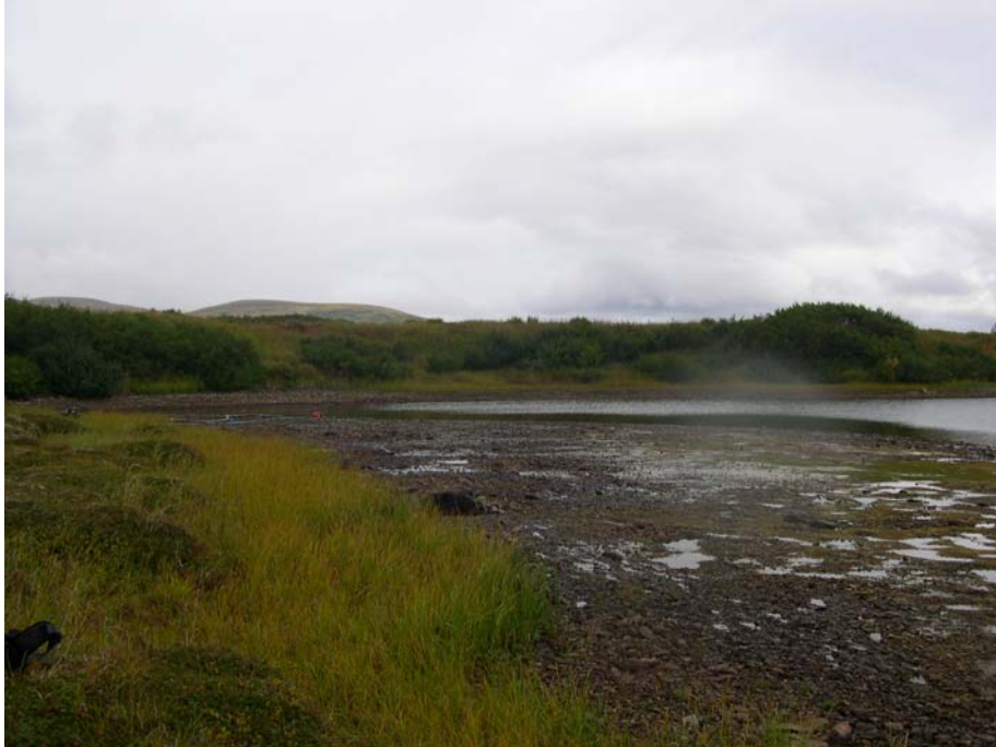
Figure 5. Water source for drill site no. 7376, note the low water level.