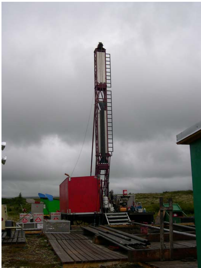
Figure 2. Visited drilling rig and pad.