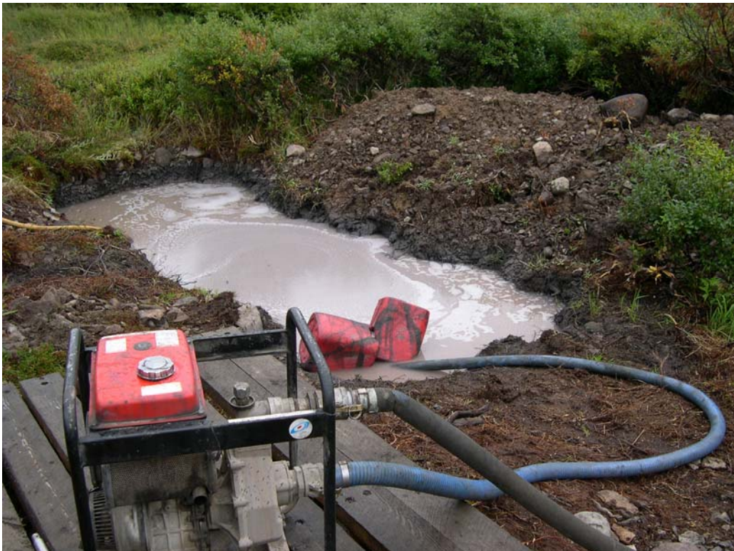
Figure 4. Settling pond at drill site.