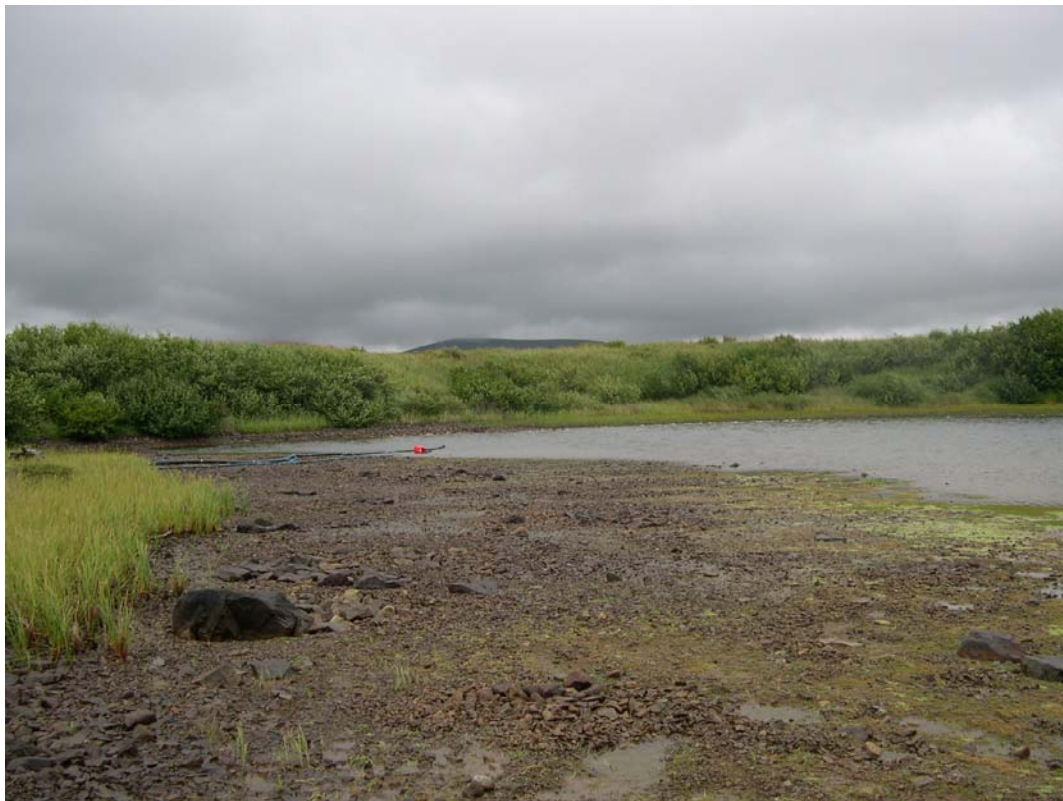
Figure 6. Primary water source and observed drawdown.