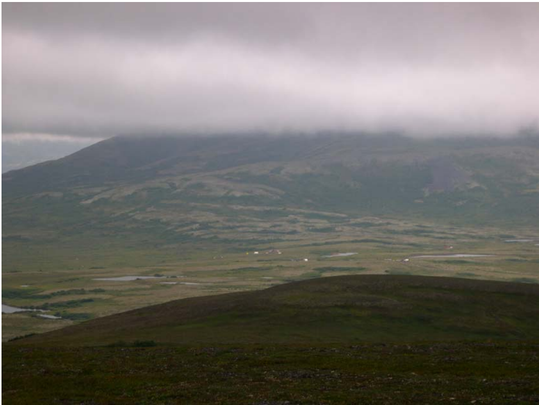
Figure 7. View of drilling area, looking east from Koktuli Ridge.