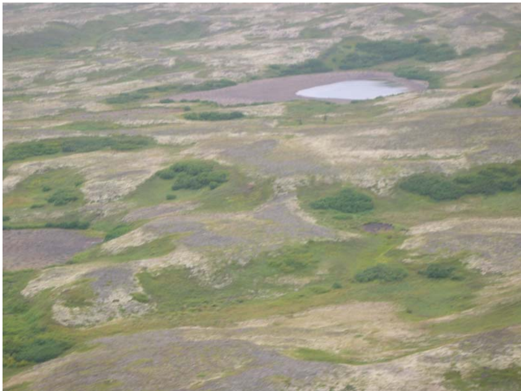
Figure 8. Typical observed kettle lake unaffected by exploratory drilling showing low water level.