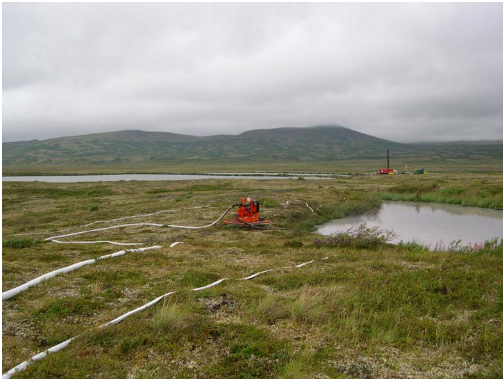
Figure 5. Centralized settling pond.