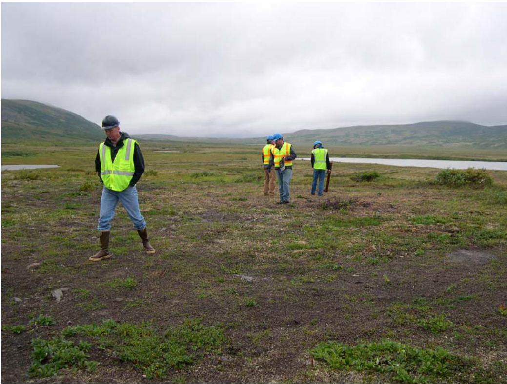
Figure 3. Location of previous drilling site.