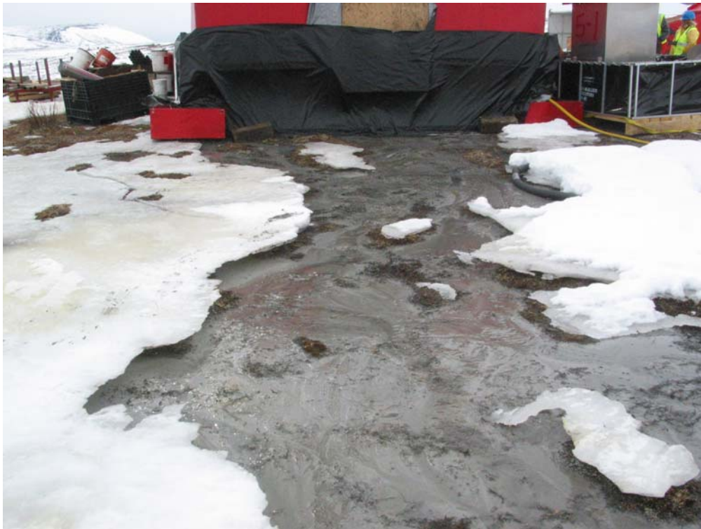
Figure 4. Water and cuttings discharge on uplands.