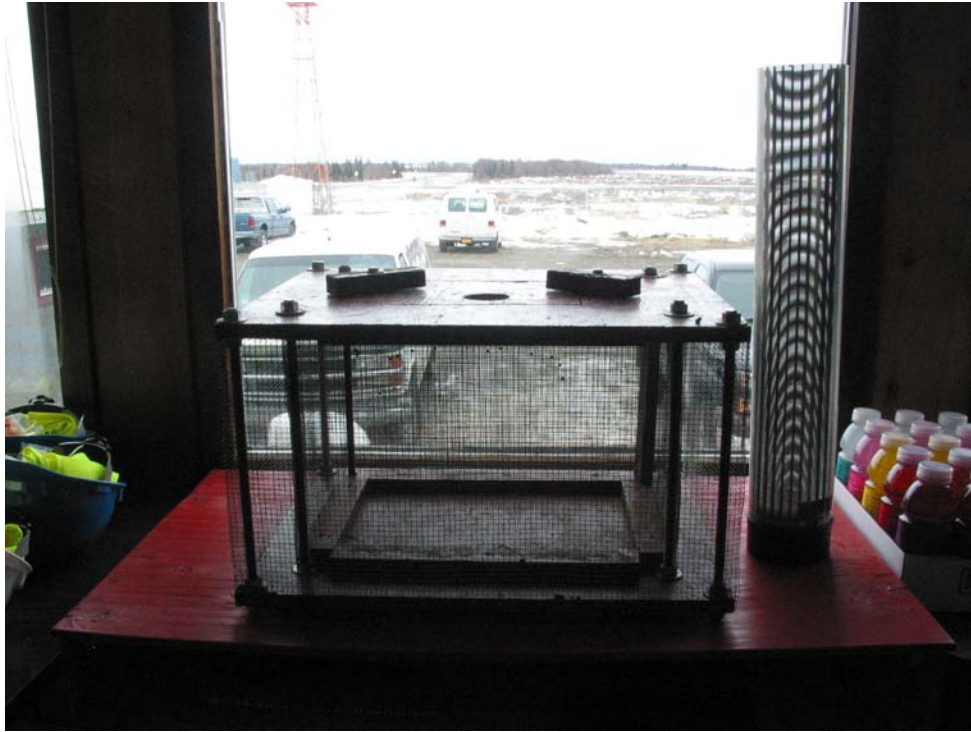
Figure 5. Water withdrawal fish screen box.