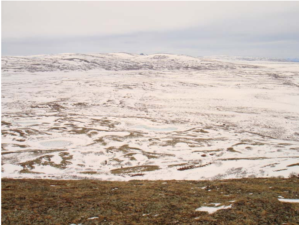
Figure 1. View from Koktuli Ridge looking west over project area.