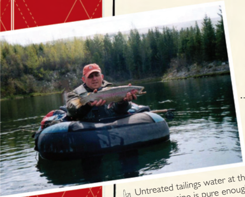
Untreated tailings water at the Gibraltar mine is pure enough to support healthy rainbow trout.